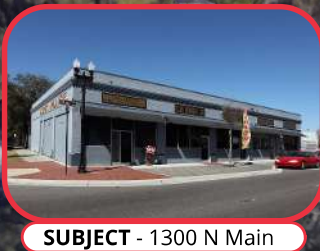
SUBJECT - 1300 N Main